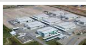
04 Regional Marine Supply Base - Warehouses & Open Yard