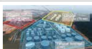
02 Liquid Storage Facilities - 986,000m 3