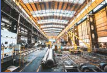
TANJUNG LANGSAT INDUSTRIAL COMPLEX