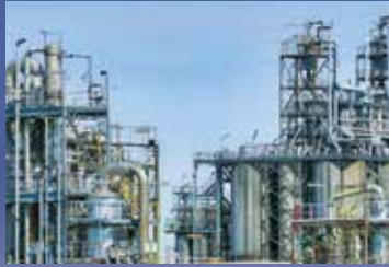
PENERANG INDUSTRIAL PARK