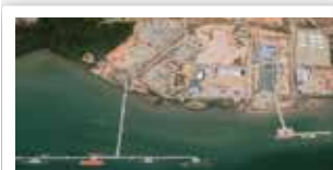
01 Tanjung Langsat Port - 7 liquid berths, 2 dry bulk