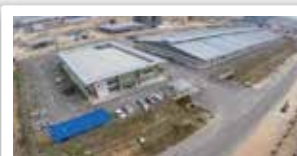
05 Palm Oil Industry Cluster (POIC) - 342 acres