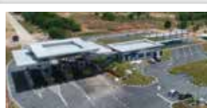
03 Free Commercial Zone (FCZ) - 187 acres